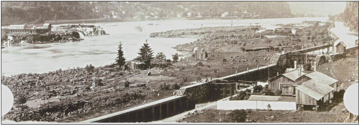
Willamette Falls Locks, 1880